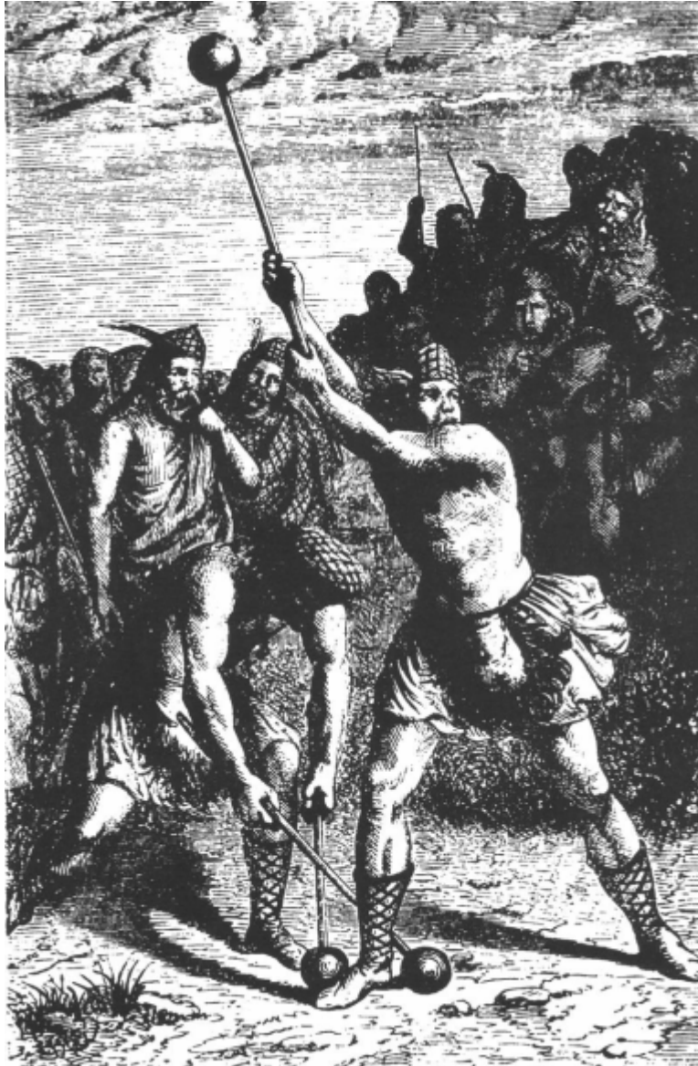
THE SCOTTISH HIGHLAND GAMES ARE AMONG THE WORLD'S OLDEST SPORTING EVENTS. THIS NINETEENTH-CENTURY ENGRAVING SHOWS AN EARLY HAMMER-TOSSING COMPETITION.

And Dinnie made a pile of money. In 1870, for example, not only did he win prize money at Caledonian gatherings, but the clubs paid his transportation and provided appearance fees (e.g. Chicago Caledonian Club paid Dinnie $100 to appear, Montreal $50). When these fees were added to his winnings Dinnie easily exceeded the unrivaled $1,400 annual salary of Cincinnati star George Wright. 6 It was a handsome return for the eldest of ten children who had started as an apprentice mason. Expressed in the purchasing power of today's money, Dinnie's life time earnings exceeded $2.5 million. 7