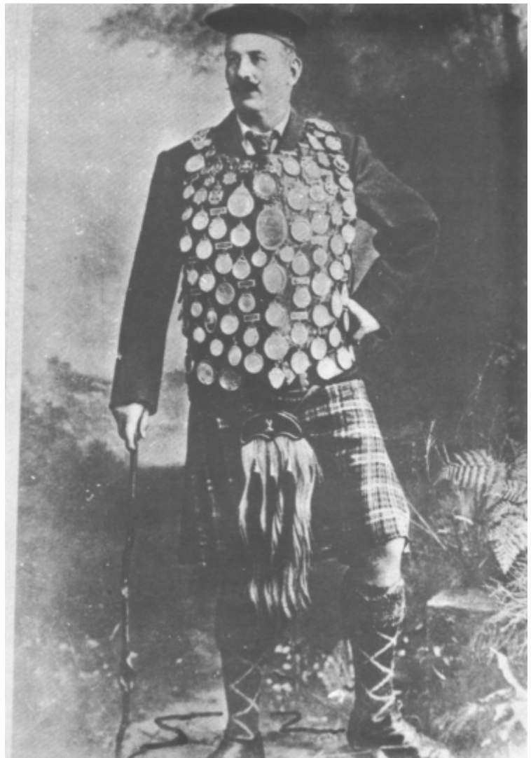
THIS RARE PHOTOGRAPH OF DONALD DINNIE WAS TAKEN IN APPROXIMATELY 1895. HE WAS THEN IN HIS LATE FIFTIES