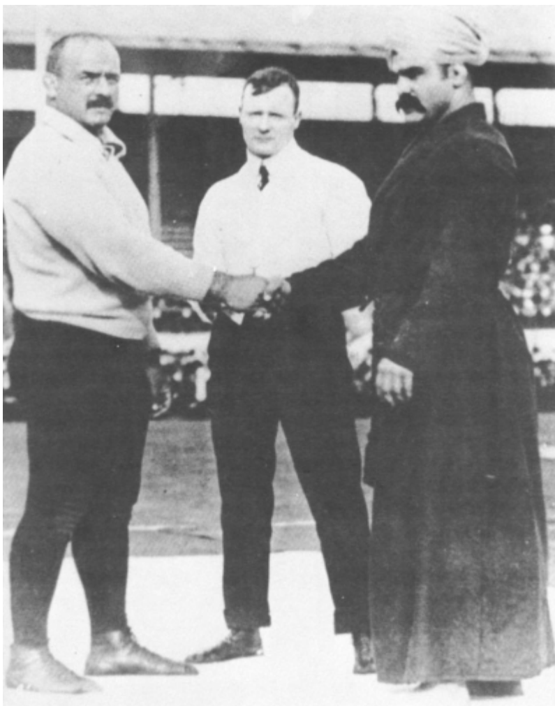
THIS EARLY PHOTOGRAPH, FROM THE PERSONAL COLLECTION OF GEORGE HACKENSCHMIDT, SHOWS GAMA AND STANISLAUS ZYBYSKO SHAKING HANDS PRIOR TO THEIR HISTORIC BOUT IN INDIA.

His attention was fully focused inward on the regimen to such an extent that he literally saw nothing but what he was doing. As a rule, he recited the name of god with every breath taken during his set of bethaks, twice for every repetition, and so you could say that his exercise routine was