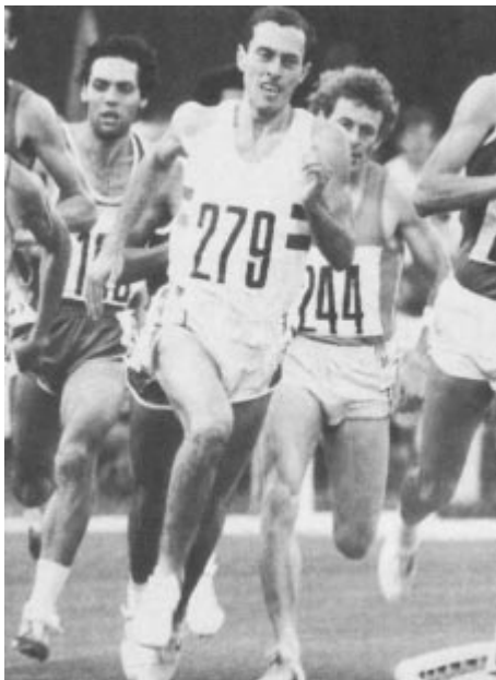
Steve Ovett, gold medallist in Moscow in the 800 m. event.