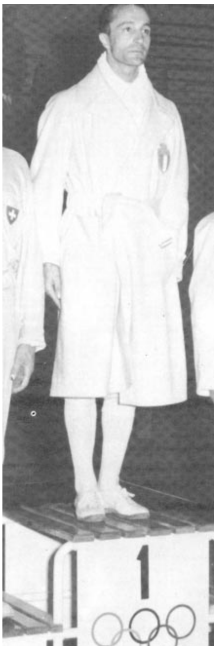
Mr. Eduardo Mangiarotti, winner of the individual epee event at the 1952 Olympic Games in Helsinki.