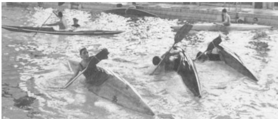
Demonstration of Eskimotage.