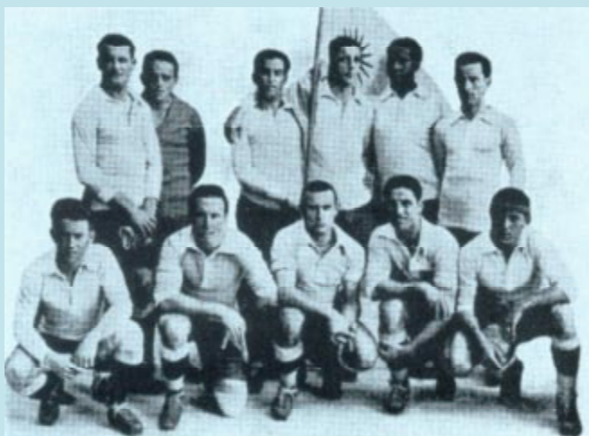
1924 : Paris.